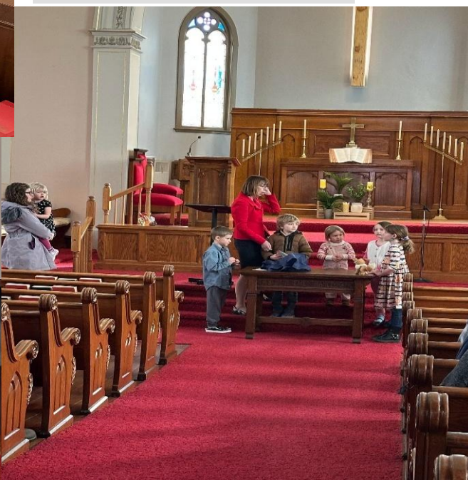
Beauty within Swiss UCC