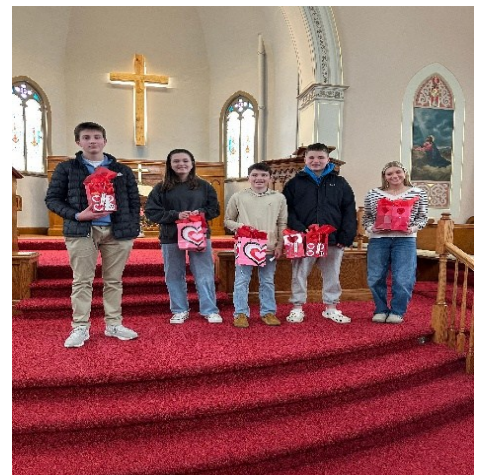
Confirmation students & friends make treat bags!